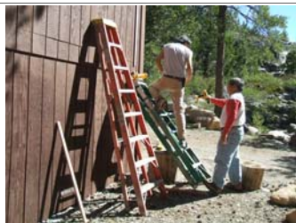
Typical Workparty Scenes

This Workparty is August 6-14th. Perhaps you can plan a week of Vacation Service! We NEED you!